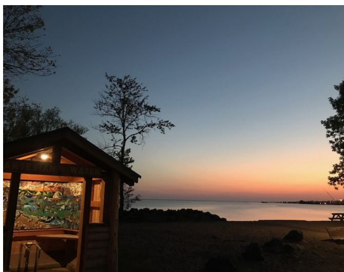
Brisk morning walks.

As we continue our way into fall, I hope you (if you haven't already) will consider joining us for our winter season of the CSA. Our Veggie and Meat producers continue to provide amazing foods through even our darker and colder months. The winter season includes two deliveries during November, and then one delivery each month through